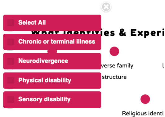
Figure 2: Screenshot from We Need Diverse Books Our Story Tool http://ourstory.diversebooks.org/kids/1.05/#quiz&ui-state=dialog

The categorization of indigenous peoples is of note across schemas. Not only is Diverse BookFinder the only schema with a distinct element for “tribe-nation”, the element is divided into 65 specific values, such as Lakota, Lakota Sioux, Cree, and Anishinaabe. Anchor Archive has an “indigenous” box category and GoodReads genre element contains the value “Native American” but neither schemas’ elements contain values that further differentiate tribal nations. We Need Diverse Books includes the value “Native, Indigenous, Aboriginal” under its “racial/ethnic identity” element and Queer Cartoonists Database includes values “first nations,” “indigenous,” and “Native American” in its “ethnicity(ies)/nationality(ies)” element.