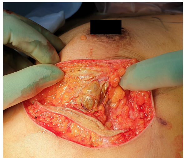
Fig. 3. Patient underwent successful nipple-skin-sparing mastectomy with immediate silicone implant reconstruction.

The patient was discussed at the Multidisciplinary team (MDT) conference. Because of the tumour size, it was decided to perform nipple-skin-sparing mastectomy with immediate silicone implant reconstruction (Fig. 3). The surgery was performed by experienced breast surgeons in a collaboration with a plastic surgeon. Final histopathological examination confirmed benign phyllodes tumour diagnosis (Figs. 4, 5). It was found to be a well-defined, encapsulated biphasic lesion with typical leaf-like pattern with low stromal cellularity. There was no atypia and no mitotic activity. Ki67