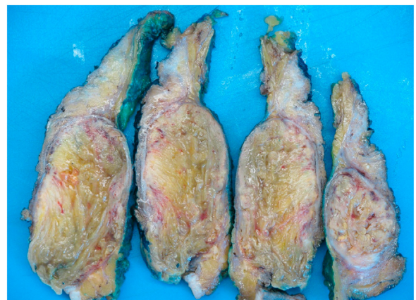
Fig. 4. Gross image of the tumour and the breast.

index showed low proliferation ratio. The biggest part of tumour was necrotized. There were no signs of malignancy. Tumour was removed radically.