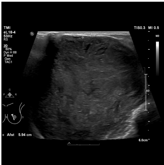
Fig. 1. Ultrasound revealed big cystic lesion on the left breast.

was repeated. This time it showed an acute and chronic inflammation, without malignancy. It was decided to perform an excisional biopsy, because there was no correlation between the histologic diagnosis and the imaging findings.