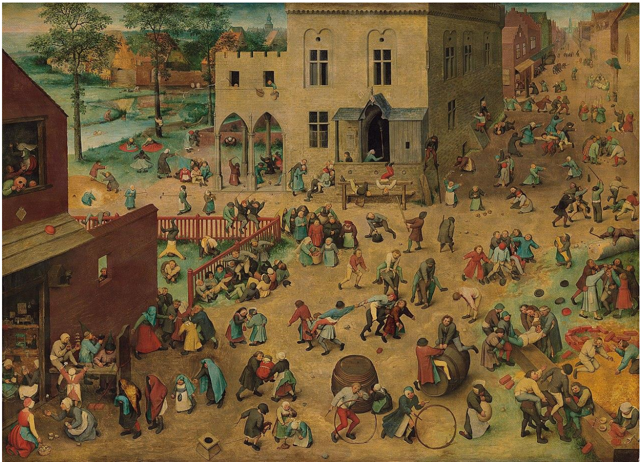
Figure 1 - Children's Games by Pieter Bruegel the Elder (1560)