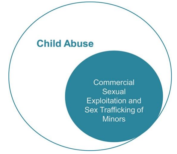
et al., 2017; Child Sexual Abuse / RAINN. , n.d.; Child Trafficking in the US , n.d.). According to the Official Code of Georgia Annotated (OCGA) § 19–– 7–5, the mandatory child abuse reporting statute requires teachers, doctors, law enforcement, and other child and family–serving organization to report any suspected type of child abuse to the Division of Family and Children Services (DFCS)