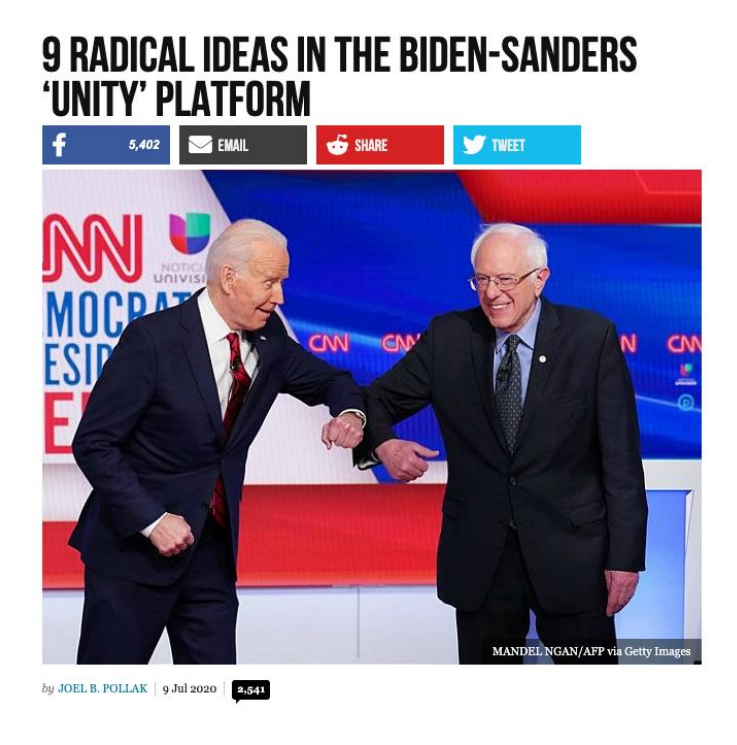
Figure 5.2 Breitbart's Biden Berning! Alternative Headline

knowledge is made up of mutually held beliefs, which "may not be true," and are "based on what people believe 'to be the case', i.e., they depend on bias, prejudice, point of view, ideology" (56-57, emphasis in the original). Accordingly, what happens during the ideational moment is an activation of extant ideologies associated with, in the case of Breitbart , the so-called "alternative-right".