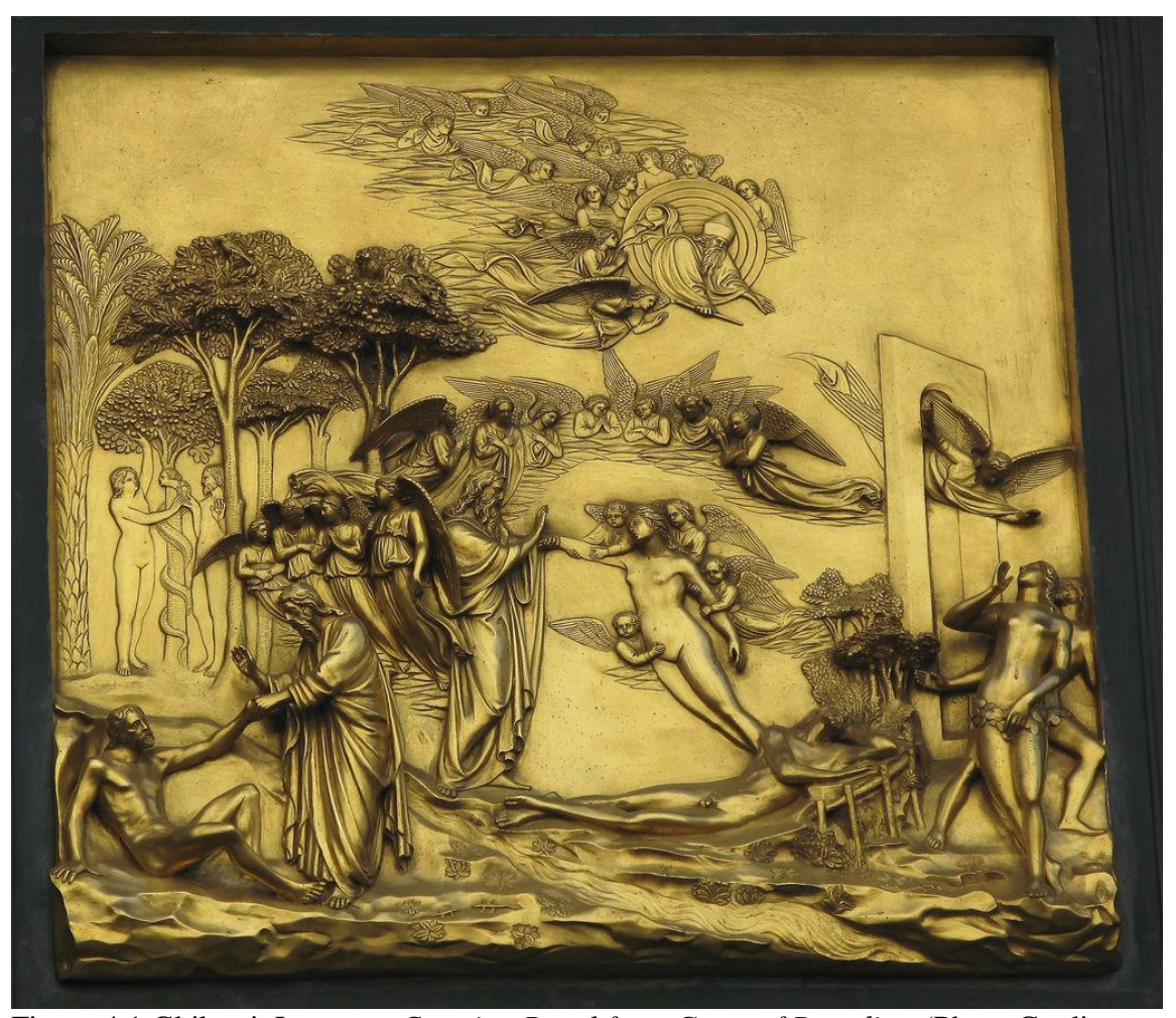
Figure 4.1 Ghiberti, Lorenzo. Creation Panel from Gates of Paradise .

Beyond dual textual functionality, paratexts are also relative with regard to the targets or their influence. As we have already observed in the preceding chapters, paratextuality operates along diverse vectors of meaning. This is why, for example, radio paratexts are just as capable of influencing a listener's perception of a serial's sponsor as they are of shaping that listener's understanding of the show itself. Likewise, this multivalent influence explains why a newspaper advertisement might do as much to situate a reader as a consumer as it does to influence that reader's engagement with the newspaper as a text.