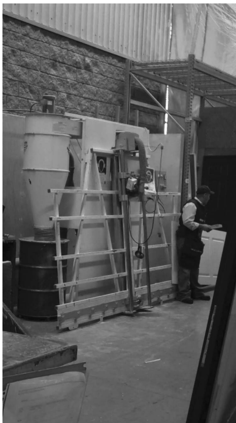
FIGURE 12.3 (See color insert.)

A vortex creates an ascendant flow to suspend the particles imitating wind. Then the suspended particles are trapped in the drops imitating rain, and absorbed in a filter that imitates deposition and soil filtration.