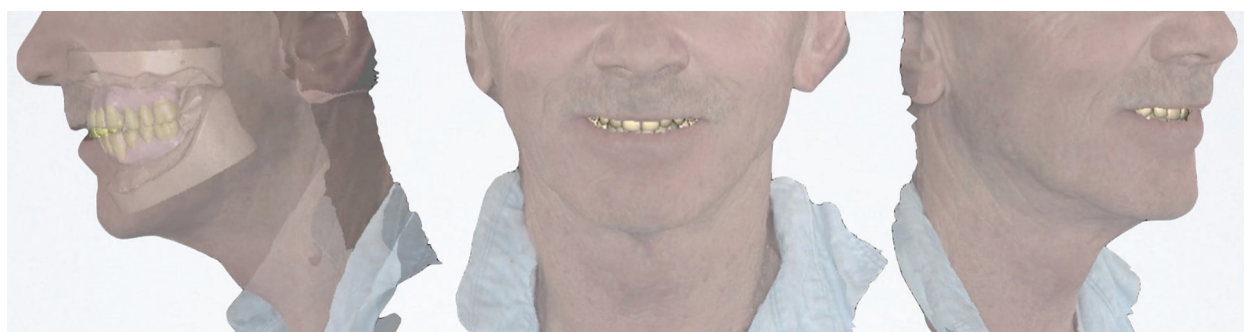
Fig. 2: Merging of a section of the full-face facial scan with the CAD design of the implant-supported prosthesis.

Upper and lower final prostheses were fabricated following a monolithic zirconia design, with the exception of teeth 13-23 that had facial/buccal cutbacks in order to layer porcelain for ideal final esthetics (Fig. 3).