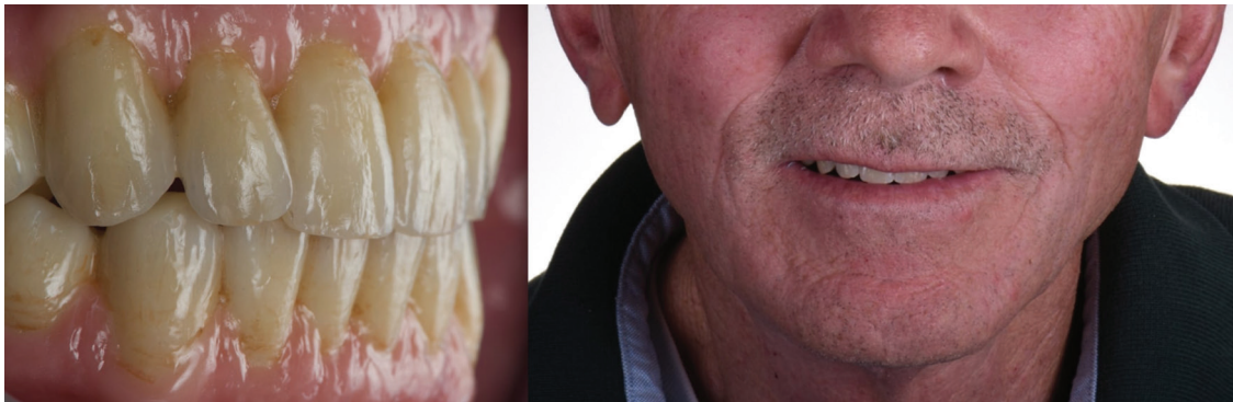
Fig. 4: Clinical outcome at 4-year follow-up since delivery of the final prosthesis.

The use of the facial scan made the prosthetic design easier for the lab technician, relating every change in tooth macrogeometry to the shape and size of the patient's face and smile. The designed followed this novel protocol and was then carried up to the fabrication of the final