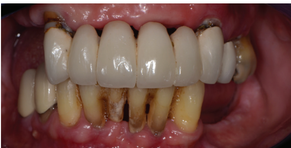
Fig. 1: Initial situation.

Clinical examination (Fig. 1) revealed partial edentu-