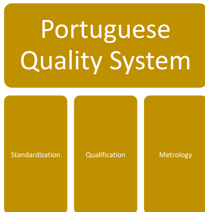
Figure 2: The three pillars supporting the Portuguese Quality System.

With metrology in all human activities, the European Association of National Metrology Institutes (EURAMET) estimates that, in developed countries, the activities and associated activities represent 6% of its Gross National Product (GNP), which in the case of Portugal reaches a value of approximately 10 billion Euros.