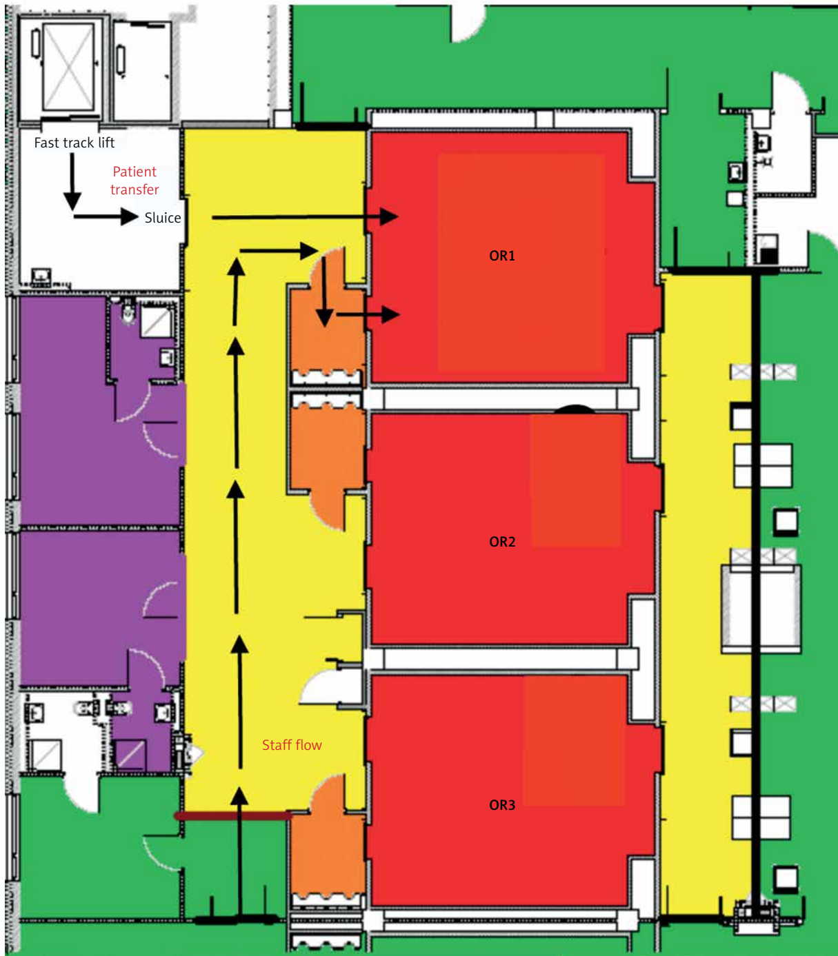
Figure 2. COVID Operating Area layout plan with patient and staff flow

positive pressure operating rooms are not airtight, and by employing technologies such as laminar air flow they limit the exposure of the sterile field to external contamination. Furthermore, in a standard OR there are multiple technical entry channels for gas pipes and electrical cables, and a great deal of