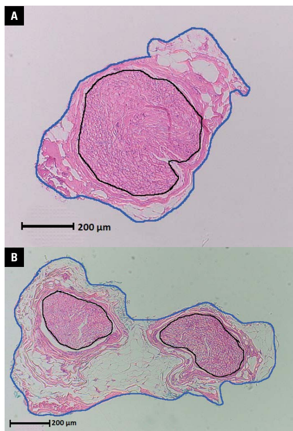
Figure 1. Specimen with single fascicle (A) and two fascicles (B) — the black line surrounding the fascicle and the dark blue line around the whole nerve.

All patients signed a written consent for a PIN neurectomy and to participate in this study. The design of this study was approved by our Regional Ethical Review Board. Intraoperative photographs were taken for documentation. All operations were carried out by the same surgeon who is experienced in wrist surgery, under regional anaesthesia with 3.5× optical magnification. The longitudinal incision was cut 1 cm ulnar to Lister's tubercle. The extensor retinaculum was opened and the PIN was found proximal to or in the floor of the 4 th dorsal compartment. The samples were then fixed in 10% buffered formalin and stayed fixed for 14 days. Then each sample underwent dehydration and paraffin embedding procedures. The paraffin cubes were cut with a microtome into 4 µm thick sections and stained with haematoxylin and eosin to visualise the nerve bundles. Quantitative analysis of individual fascicles and the whole nerve itself were carried out using the Olympus BX43 microscope. Photographic documentation was achieved using an Olympus SC-100 camera. The photographs were then analysed using Image J. The number of fascicles in each nerve, the surface area of each fascicle, and the thickness of the perineurium of each fascicle were evaluated. The surface area of the fascicle was calculated with the help of the Image J program using a variable scale of