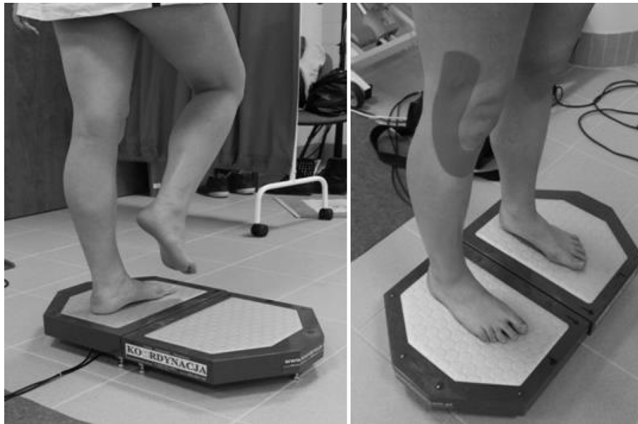
Measurement of the stabilographic parameters.