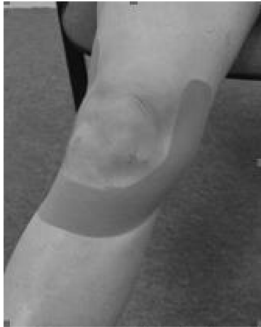
Application of kinesio tape