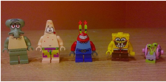
Figure 1. Introduction Slide