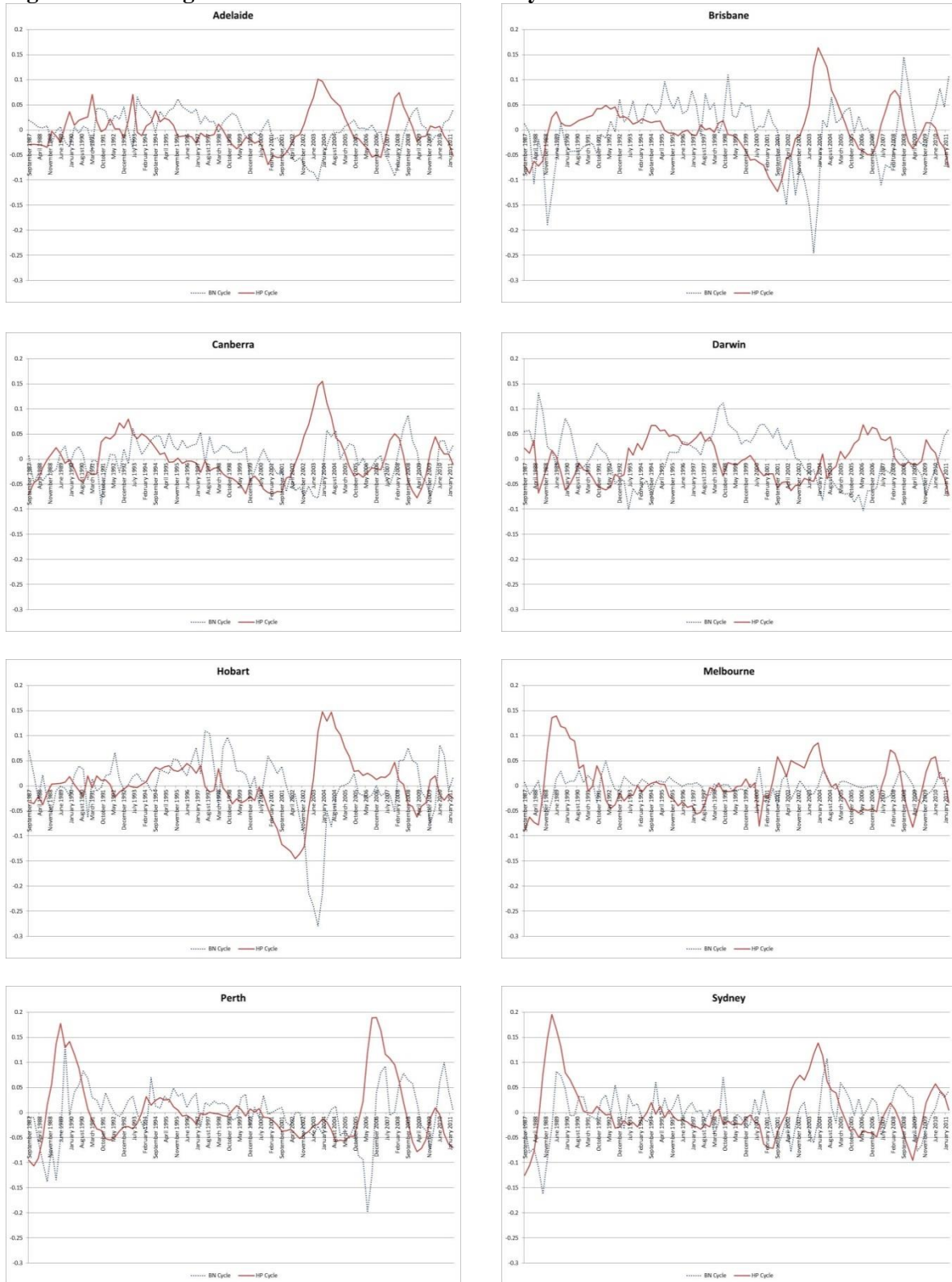
Figure 2: Beveridge-Nelson and Hodrick-Prescott Cycles

Notes: Figure 3 displays the cyclical components for the eight markets as estimated using both the Beveridge-Nelson and Hodrick-Prescott techniques.