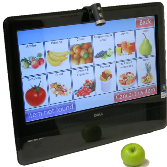
Fig. 2. NANA system showing nutrition data entry.

ageing (Deary et al., 2010) and the tasks developed for NANA were based on existing gold standard measures used in the assessment of cognitive function. The white square task was a simple measure of processing speed requiring participants to touch a white square as quickly