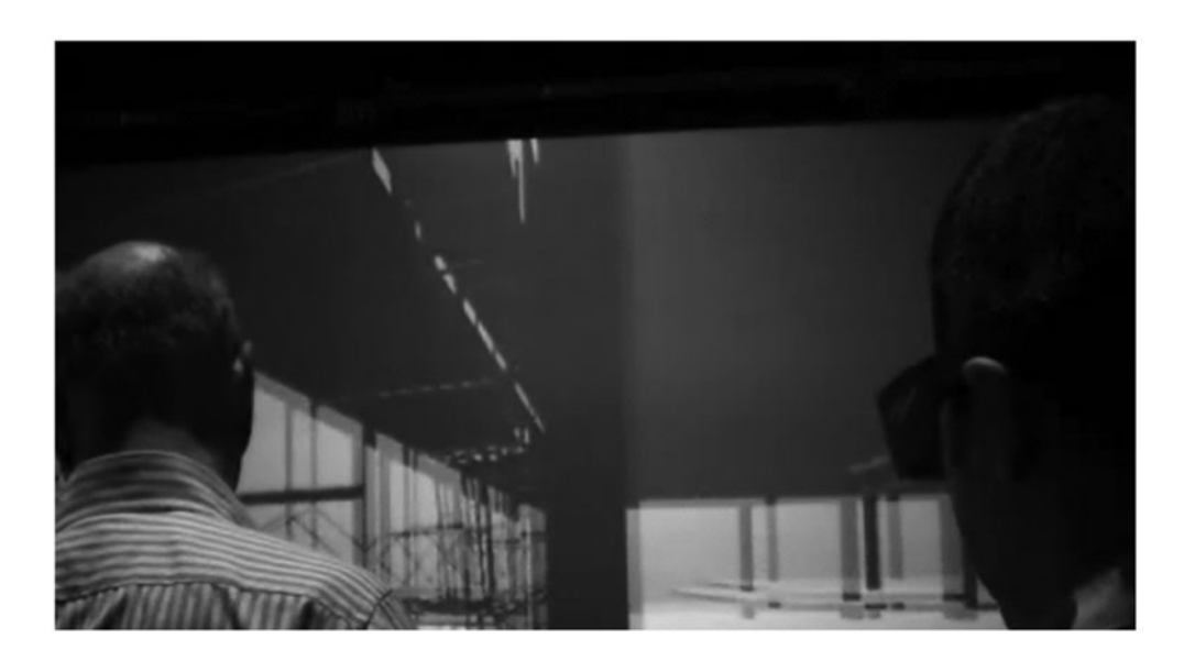
Figure 1 Safety professionals inspecting a scaffolding scenario in the CAVE

A high-rise residential project was chosen for the virtual construction site because a large proportion of the recorded accidents are falls from height or involve