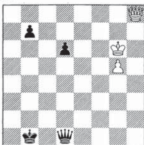
g6b1 4000.12 after 50...d1=Q