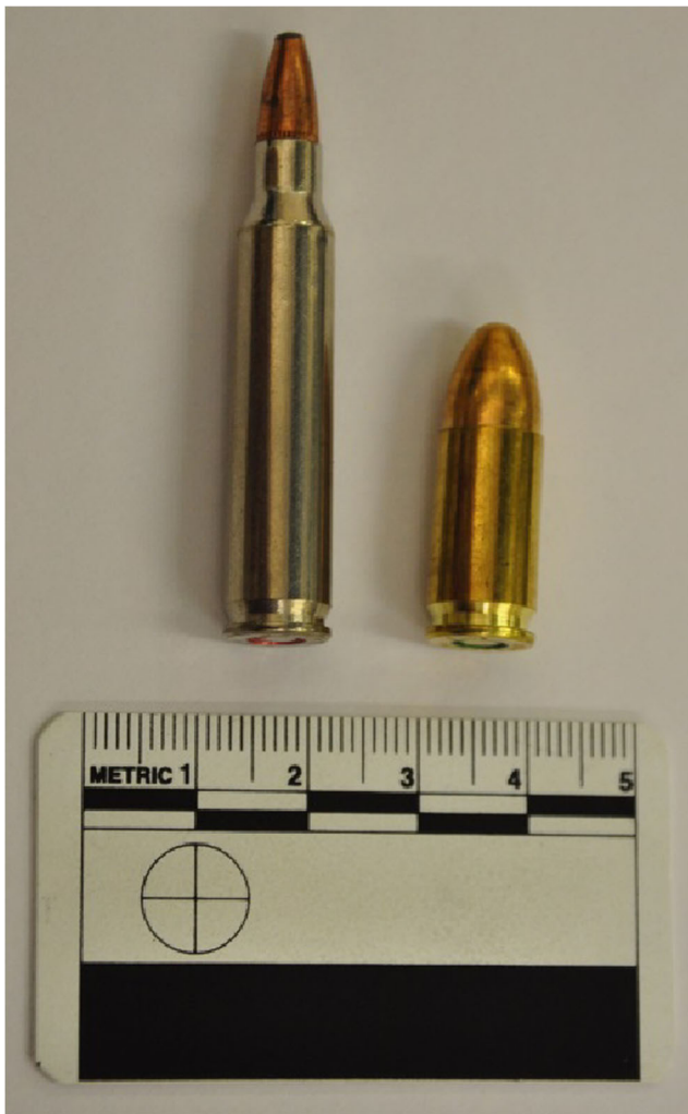
Fig. 1 .223 Remington (5.56 × 45; 62 grain; Federal Premium® Tactical® Bonded®) (left) and 9 mm Luger (9 × 19 FMJ; 124 grain; DM11 A1B2) (right)