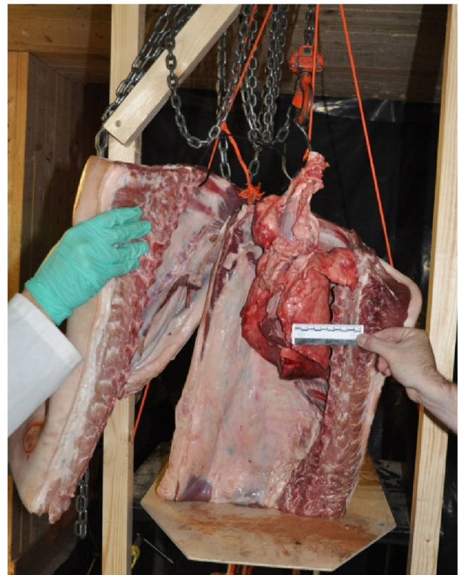
Fig. 2 Typical set up showing the arrangement of the thoracic walls and lungs

The porcine samples were arranged 10 m down range from the end of the muzzle to simulate a thorax; a porcine thoracic wall was placed as the anterior of the target (skin facing muzzle), then a set of lungs positioned in relation to the thoracic wall as they would be anatomically in a human, followed by another thoracic wall (skin facing away from muzzle) (Fig. 2). In order to ensure that a complete bullet tract was captured, a 10 % gelatine block 500 mm in length was placed adjacent to and in contact with the posterior thoracic wall. An Enfield Number 3 Proof Housing, with the appropriate barrel fitted, was used to fire each ammunition type. Each individual shot was aimed with the goal of striking: a rib within the anterior thoracic wall, either the left or right lung, and a rib in the posterior thoracic wall, before capturing the rest of the tract in a gelatine block (calibrated as above). Shots that were fired onto the same thoracic sections were located to ensure damaged areas did