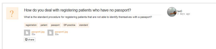
Figure 1: Question with attached Multimedia

The Q&A tool [Dennerlein, 13; Dennerlein, 15b] relies on the SSS [Dennerlein, 15a] and the services it provides, such as Q&A enrichment by multimedia and intelligent recommendation services. The multimedia Q&A enables users to start a question related to a certain already gathered document (see Figure 1) or a simple text based question, for example: 'How do you deal with registered patients who have not passport'. Once the question is stated, the SSS is queried for similar questions (see Figure 2).