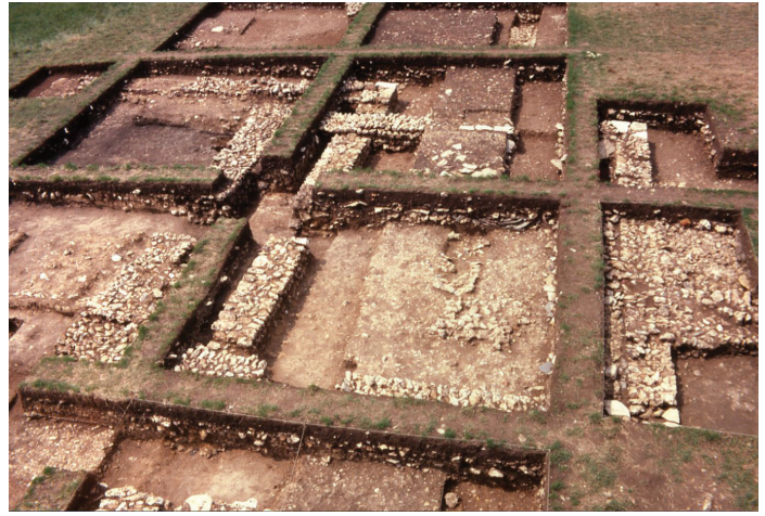
Left: Fig. 2. Room 11, the reception room and apse. The earlier remains of part of Room 15 can be seen in the bottom right-hand corner. Right: Fig. 3. Box grid excavation in progress. The square foundation plan with attached porch of the shrine-like Building 1 (right and centre) can be seen to overlie the earlier north-east end of Building 1 (left).

Informative interim reports were published in the Proceedings of the Dorset Natural History and Archaeological Society for each season from 1969 to 1975. Thereafter they decline in length and usefulness which is a particular problem when trying resolve issues relating to Building 1 (an aisled barn), for which most of the plans and sections are missing also.