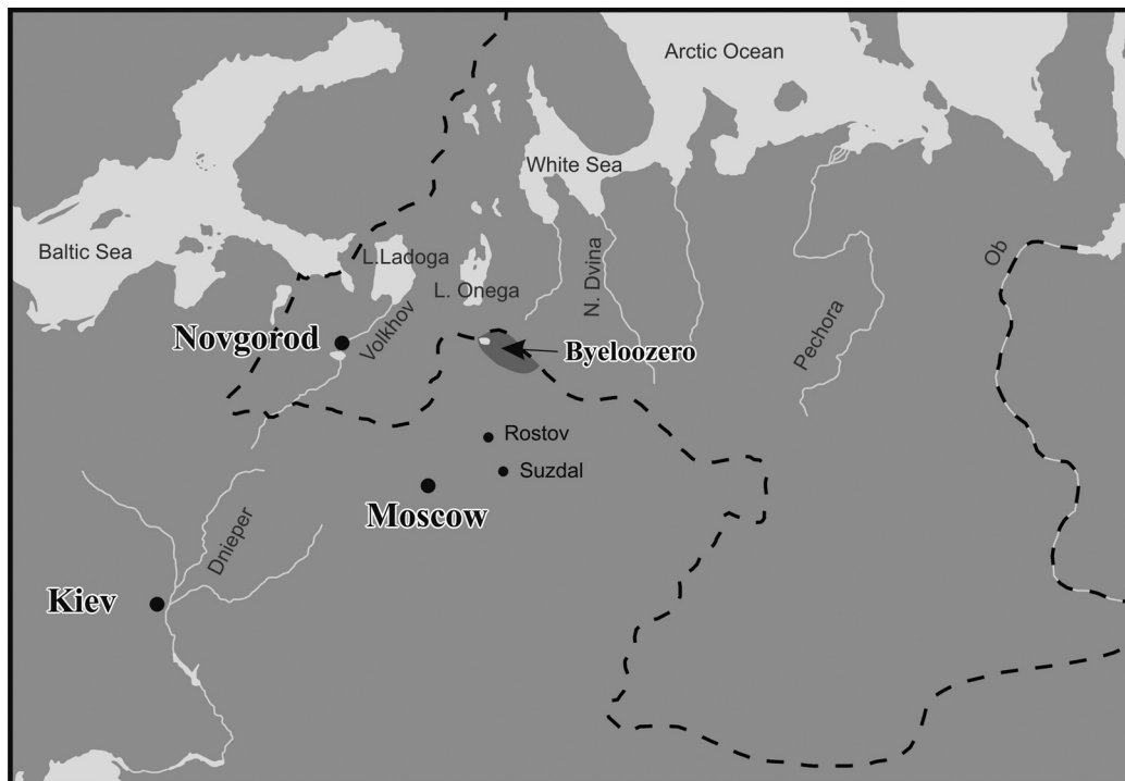
Figure 1.2 Map of Novgorod Land around AD 1400. After Yanin 1990, 74. Redrawn by Mark Dover.

from those in the immediate vicinity of the city. These differences can be observed in relation to their economic development, the role of crafts, agriculture, trade, hunting, fishing and various other activities. Nevertheless, the wide-ranging and detailed study of medieval sites such as the settlements at Minino on Lake Kubenskoye, together with the analysis of materials from Novgorod's immediate environs and Novgorod itself, help us to understand the historical and cultural processes at work within the northern part of the medieval Russian state at various stages of its history.