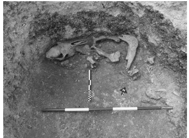
Figure 4: The basal level of an Iron Age pit (F10103) containing the disarticulated remains of cow and horse.

enclosure ditch, bone and charcoal providing a radiocarbon date (at 95% confidence) of 360-88 BC (UBA-18459), suggesting that the slow accumulation of ditch soils could have begun in the early half of the fourth century BC. The funnelled entrance passage, which seems to have been part of the primary design of the enclosure network, rather than representing a later addition, modification or elaboration, contained at least six horse skulls, all missing their mandibles, from the mid to upper fill. It is possible that the entrance approach to the Winterborne Kingston banjo had originally been decorated with multiple horse heads and that these had quietly rotted, before falling, or being discretely placed as part of an offering, within ditch fill.