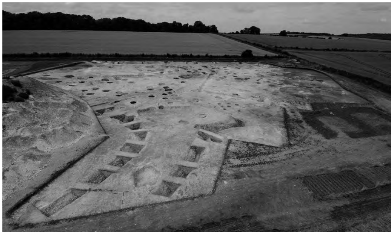
Figure 2 The interior of the Winterborne Kingston banjo enclosure under excavation in 2011 looking north through the entranceway to the interior (Adam Stanford, Aerial Cam).:

Little was found in the basal fill of the banjo