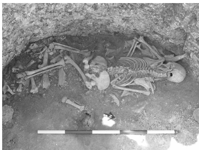
Figure 5: The fully articulated skeleton of an adult male, close to the base of an Iron Age pit (F5059) dating to the early 1st century BC, lying face down over a major deposit of disarticulated cow and horse bone.

Finally, between around AD 20 and AD 90, at a time when the banjo enclosure appears to have been going out of general use, the interior gave way to more prominent, organised forms of burial, a series of sixteen bodies, male and female, being laid down within shallow, oval graves (Fig. 7). These can best be defined as Durotrigian burials, conforming to the formal, distinctive style of wider tribal deposition (Papworth 2008, 82-6), bodies lying predominantly on their right side, heads to the east, facing north, legs flexed in foetal positions (Figs 7 and 8). Grave goods, where identified, comprised Black Burnished Ware pots placed in the vicinity of the head and shoulders, or the occasional joint of pork or beef. Many had a single bronze fibulae brooch often located around the back, at or close to the head, which may indicate that the remains were originally wrapped in a shroud or placed in a bag pinned together at the top.