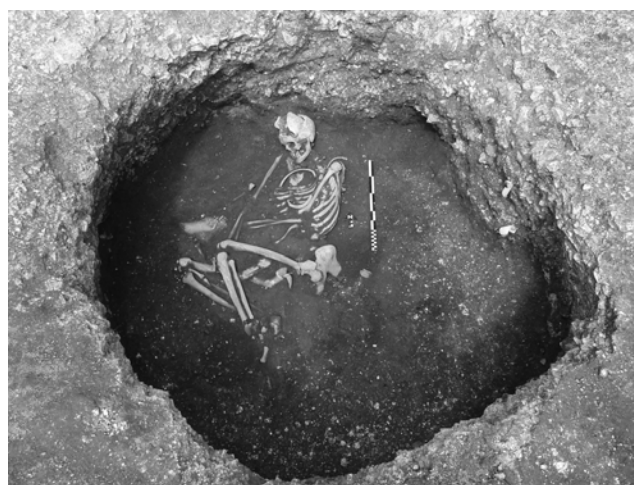
Figure 6: A formal burial deposit of an adult female set down within the upper fill of a disused Iron Age pit (F413) excavated in 2012 (Miles Russell).