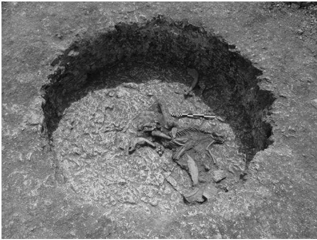
Figure 3: The fully articulated remains of a dog with disarticulated cow and horse bone, from the basal levels of an Iron Age pit (F3051) excavated in 2013.