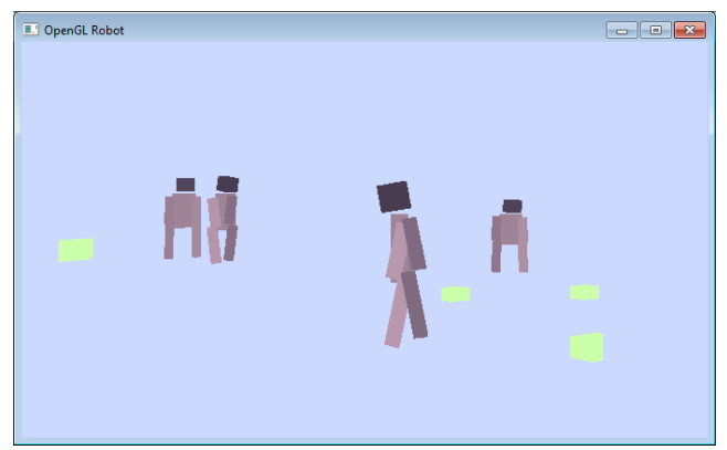
Fig. 2. Developed robot motion simulator.

Finally when food quantity was increased to an amount where all agents could survive. When the amount of food was