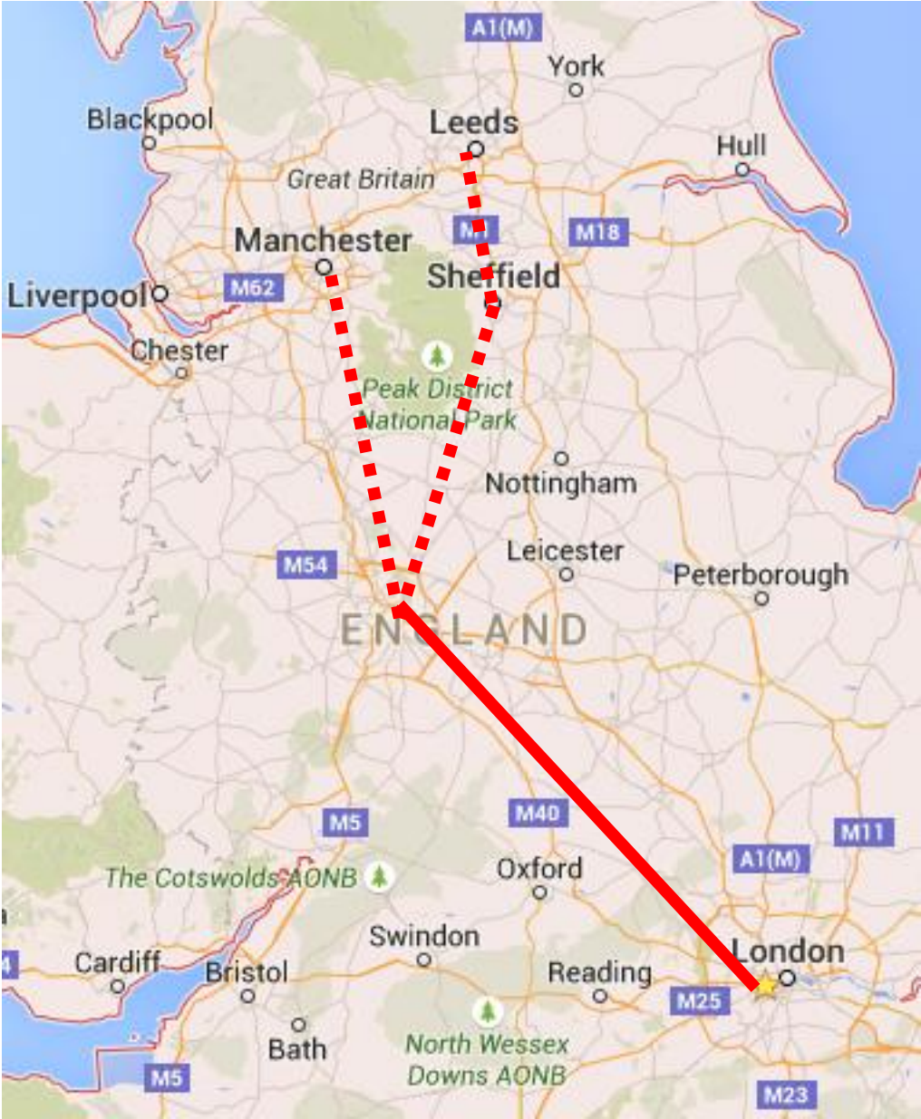
FIGURE 1: HS2 ROUTE