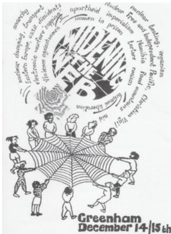
Figure 1: Cover of pamphlet, widening web

Each of these invocations and understandings of webs at Greenham resemble Haraway's conception of weaving found in her cyborg manifesto. 'Weaving,' for Haraway, is the practice of oppositional cyborgs. It is the differential movement/s of cyborg collectivities capable of blocking, harness, redirecting and appropriating flows of patriarchal and capitalist power in the "integrated circuit" (Haraway, 1991). By the time Greenham women were actively camping onsite, weaving practices had already been explicitly put to activist use against militarism. A few years before the Greenham encampment began, a Vermont women's affinity group named the Spinsters had woven shut the gates of a nuclear power plant using wool, string and rags (King, 1983). At the first meeting for the Women's Pentagon Action, this story of the Spinsters was shared with the group of event organizers. Then, at the 1981 Women's Pentagon Actions, the Spinsters and