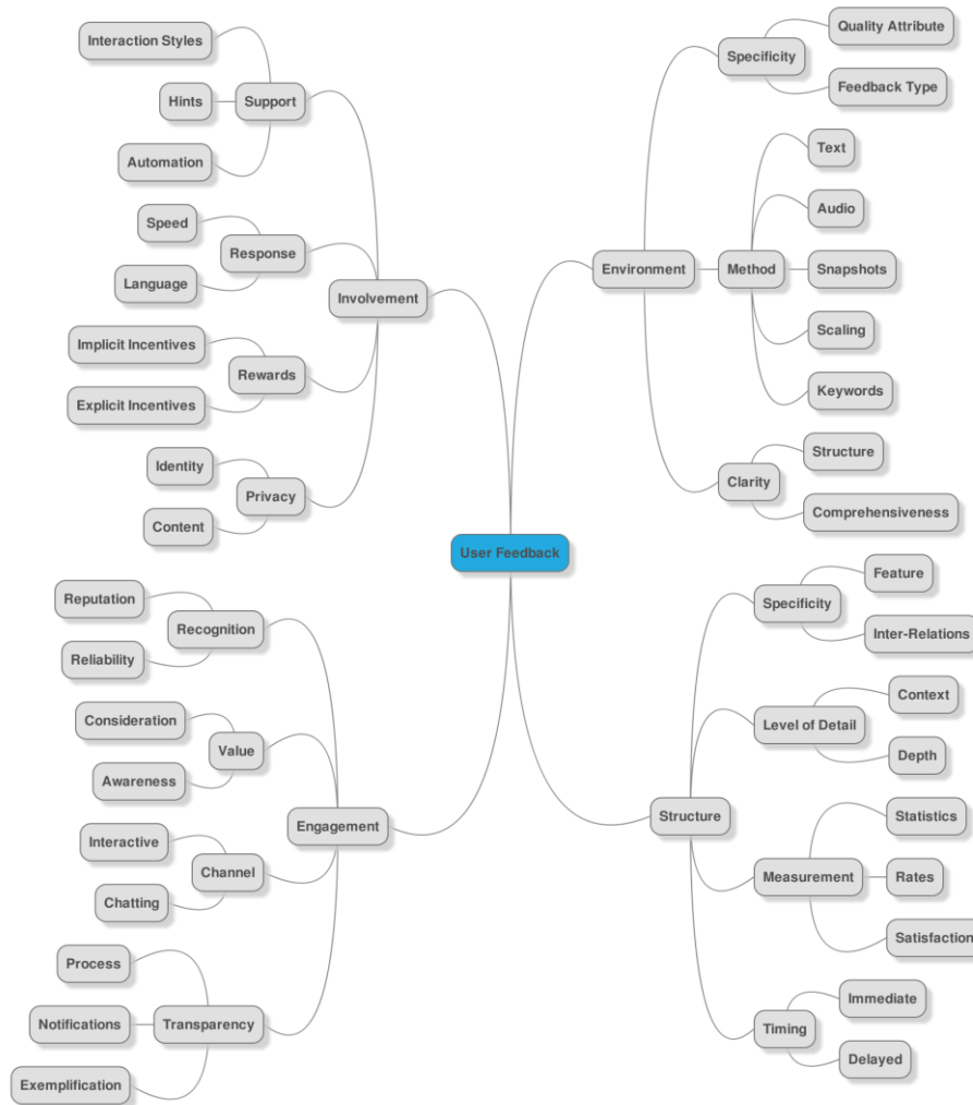
Fig. 1. Focus Groups Final Thematic Map

Engagement refers to the key merits the acquisition process provides to the involved users that encourage them to take part as evaluators. This includes some key characteristics of engaged users with the process, and also the qualities that are important to the process. This includes Recognition, Value, Channel, and Transparency. In details, participants mentioned that they would like to be recognized through their reputation . Reputation may be considered as a component of identity as defined by others. Reputation is a vital factor in any community where trust is important. Also, users would take recommendations, and/or solutions into consideration if they are given from reliable users. The reliability of users increases the weight of their feedback. Moreover, users like to be valued in a way in the participation. Participants mentioned that their feedback is valued by knowing that it