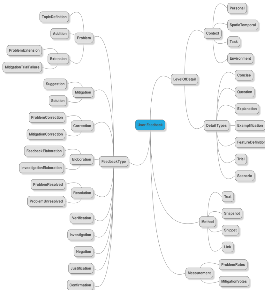
Fig. 2. Forums Analysis Final Thematic Map

This means that a feedback thread may contain multiple problems along with the replies. From the definition of this feedback type as a complex type, this implies that it must contain other feedback types in its definition, which in this case are Confirmation or Negations that must reference another problem. Therefore, it cannot reference a feedback post that contains Mitigation, because by definition we use this feedback to add a problem to a problem.