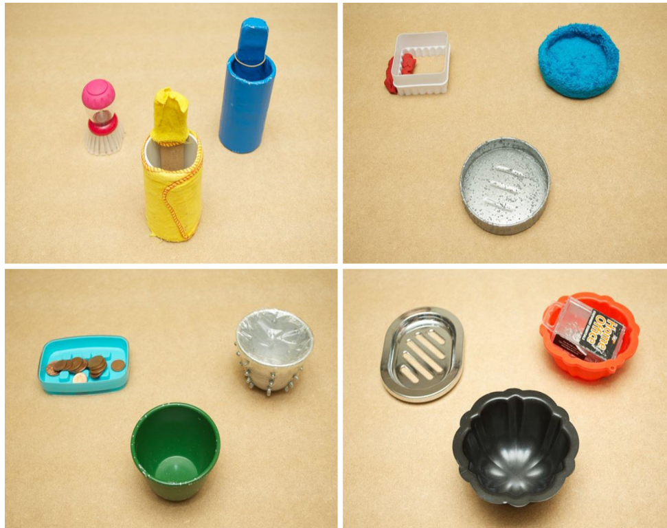
Fig. 1 The four object sets. Novel objects ( centre ) (from left to right , with designated function in brackets): puppet stand covered with Mr. Sheen duster (dusting), silver sandpaper covered soap dish (cutting playdough), unaltered green bowl (holding coins), black jelly mould (making music). Function match test objects ( left ): dish brush, cutter,

soap holder, soap dish. Shape match test objects ( right ) (with designated function in brackets): puppet stand painted blue (hanging hair ties), soap dish covered with blue towel (mopping up water), bowl with plastic cover around the top (sticking), red jelly mould (holding paperclips) (Color figure online)