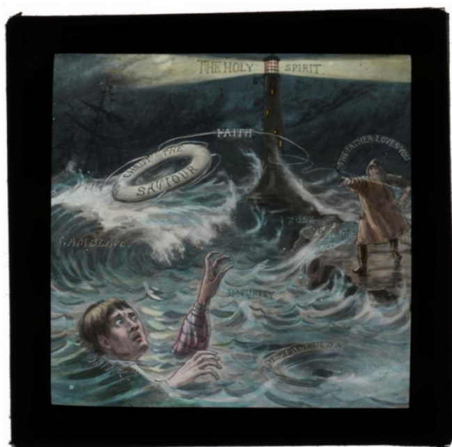
Figure 1 makes explicit the interventionist role which members of the total abstinence, or 'teetotal' movement were expected to fulfil with respect to alcohol. This magic lantern slide, part of a flexible Victorian technology which was widely

drink as so powerful and volatile that a single drink may put one on the road to the hospital, the poorhouse or the jail. Therefore, the argument goes, the only way to avoid risk is to avoid drink entirely. Risk avoidance, therefore, was at the heart of teetotalism and the agents for encouraging risk prevention were often children. Many temperance organisations were closely linked with Christian belief or set up under the auspices of religious groups, and moral responsibility was also appealed to, as well as enlightened self-interest. It is as well to remember that deeper resonances operated after formal links with religion had begun to decay; as Iain Wilkinson remarks, 'Within a secularized cosmology, risk adopts the traditional mantle of sin' (2001: 4). In the material which this paper considers, the risks which alcohol could present were frequently and uncompromisingly linked with sin, which individuals and society were shown as having a duty to oppose.