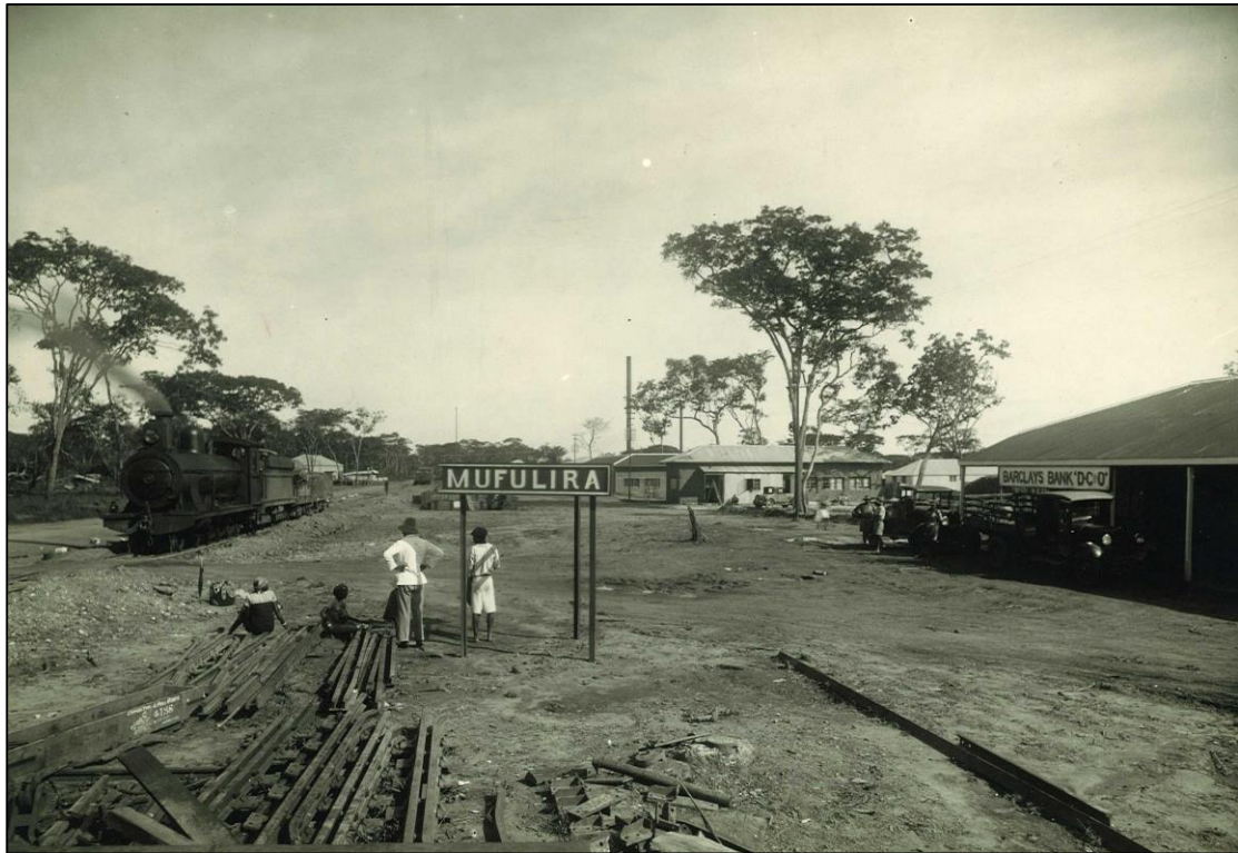
Fig. 3 Mufulira Branch in Northern Rhodesia's copperbelt in the 1930s.