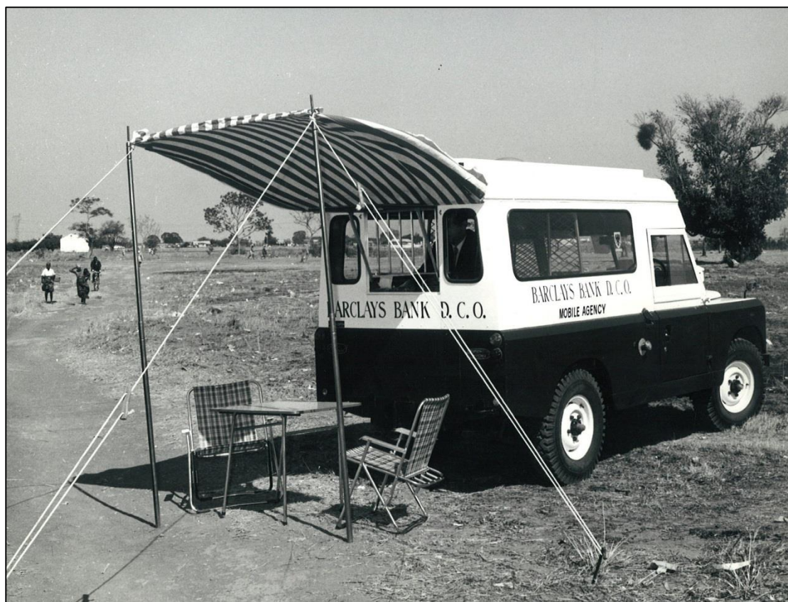
Fig. 6. Zambia mobile branch pictured in 1967

Generally speaking, the DCO/BBI archive is under-used. This article has barely skimmed the surface of the rich and varied material it contains. It has relevance far beyond the world of banking, and can tell us a huge amount about the territories in which Barclays operated, and the British attitude towards them during a time of immense change. Barclays invites more researchers to make use of these untapped riches.