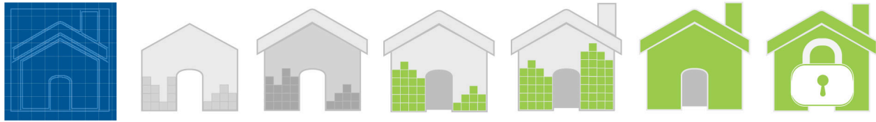
Figure 1. Iconography used within the game to represent the stages of property development.