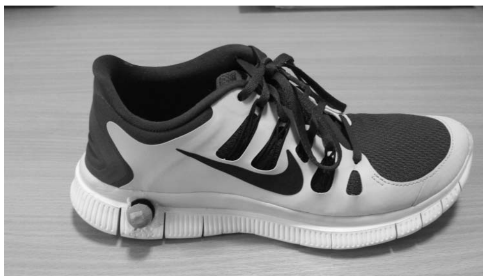
Figure 1. Experimental footwear fitted with 10-mm marker.

10-mm marker was positioned on the top of the shoe midsole at the rear of the shoe (Figure 1).