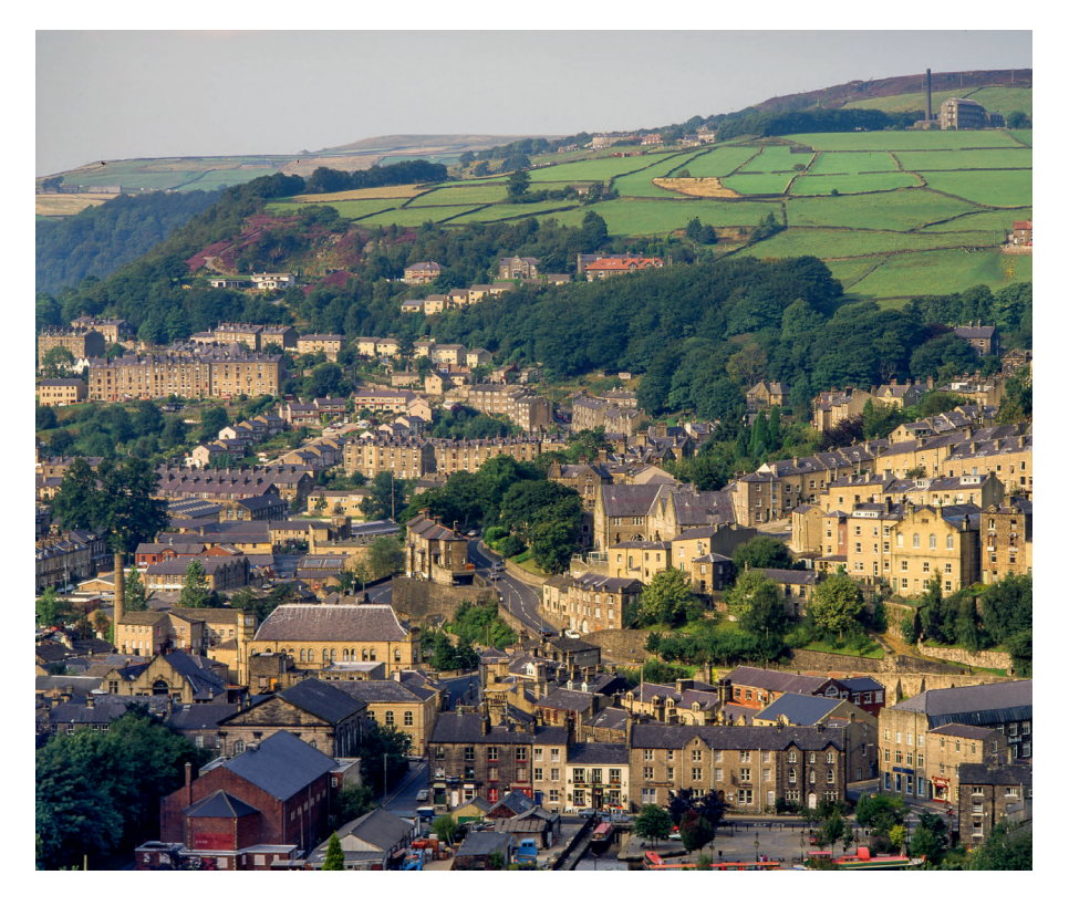
Hebden Bridge

Originally defined by hill farming, the development of the cotton trade in the nineteenth century transformed Hebden Bridge into a thriving mill town and dotted the landscape of the valley with cotton mills, drawing labour away from the land and from surrounding villages. By the 1960s, however, the decline of the industry meant a lack of local employment, few facilities and deteriorating housing stock in both Hebden Bridge and the surrounding villages (Spencer, 1999).