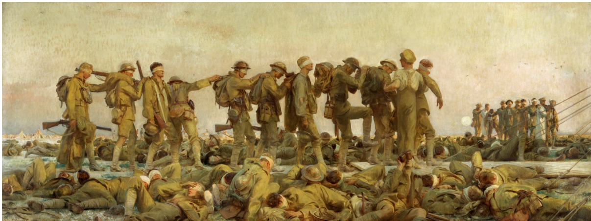
Figure 3. John Singer Sargent, Gassed .

Gassed (See Figure 3) is a very large oil painting on canvas, 231 cm x 611.1 cm, dominated by a line of ten gassed and blindfolded soldiers being shepherded by a medical orderly along a duckboard path towards the CCS reception tent, off canvas to the right. Further away, a line of eight more gas victims, guided by two orderlies, approach obliquely from the right. The duckboards are surrounded by blindfolded soldiers lying down, probably already assessed and treated, and now awaiting an ambulance train to transfer them to a base hospital. 51