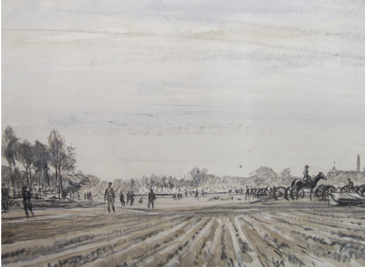
Figure 2. Muirhead Bone, Artillery Men at Football .

kick-about but sports kit was still in short supply and formal matches were often played in breeches and shirt sleeves at this stage of the war. 42 On the far side of the pitch are many bell tents, the living accommodation for the gunners.