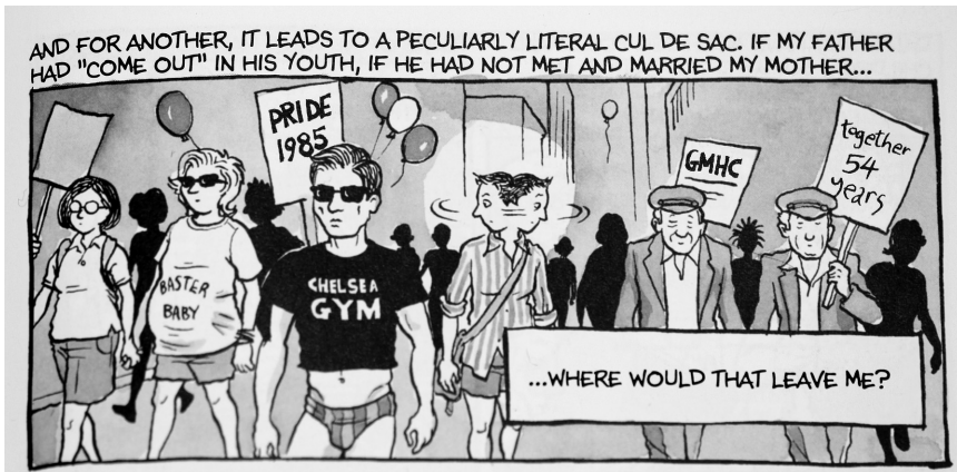
Figure 2 From Fun Home: A Family Tragicomic by Alison Bechdel. Copyright ©2006. Reprinted by the permission of Houghton Mifflin Harcourt.