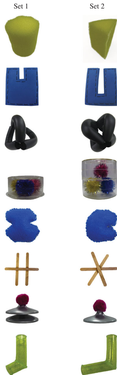
Figure 1. Novel objects. Infants explored all objects from one of the sets; images of pairs of objects from both sets were used as stimuli during Test phase. (Online version in colour.)

EEG analysis: Video recordings were coded frame by frame (25 fps) and time intervals during which the infant was visually attending to the object were extracted for EEG analysis. The raw EEG data were imported to EEGLab, Fieldtrip, and visually screened for motion and eye-blink artefacts. Epochs of 1 s were then extracted from periods of continuous artefact-free data (any remaining samples were discarded; artefact-free segments were not concatenated but segmented separately) and fast Fourier transformed (Hanning window, 50% overlap) to yield a