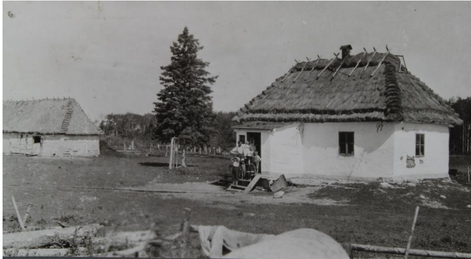
Figure 1. Ethnic architecture in Manitoba as documented in Ledohowski and Butterfield's Architectural Heritage in the Eastern Interlake Planning District (1983). The figure shows a Ukrainian farm in Fraserwood, 1915, illustrating an example of a typical second home in the Interlake region (p. 68). The study of vernacular architecture has played a foundational role in creating ethnic identities across North America. For good overview, see Noble, To Build in a New Land.

Oliver, J. & Edwald, Á (in press). Between islands of ethnicity and shared landscapes: rethinking settler society, cultural landscapes and the study of the Canadian west'. Cultural Geographies . DOI: 10.1177/1474474014561576