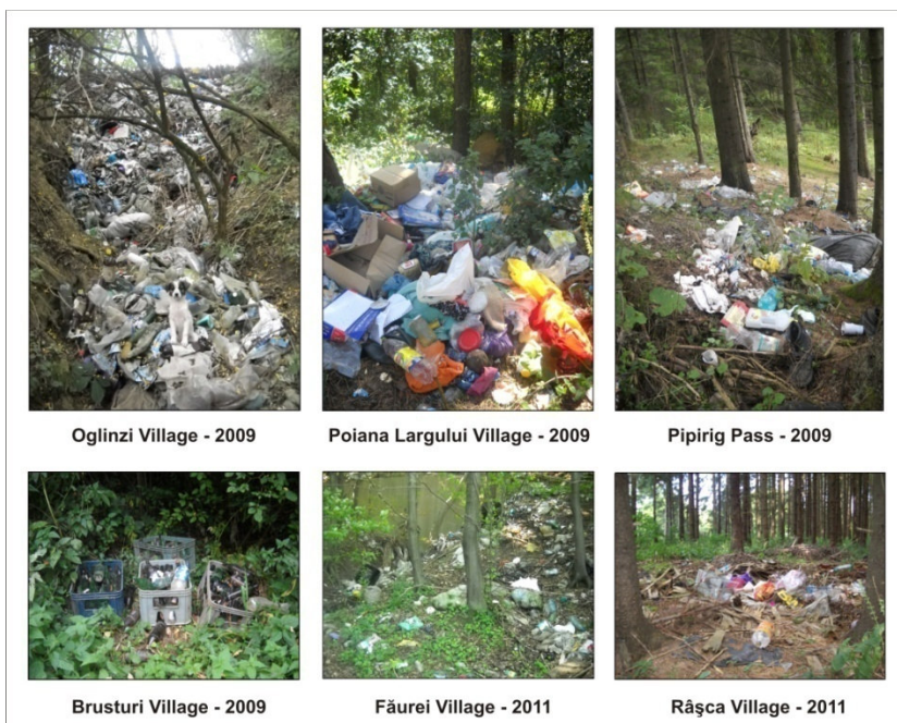
Figure 2 Waste dumping in forest areas - field observations

In the Carpathian areas, near settlements Râșca, Boroaia, Mălini, one can see forest areas affected by visible aesthetic degradation. Because of proximity to rural settlements, the rivers and tributary streams from mountain region are more vulnerable to waste pollution. Most of the waste generated and uncollected is partially recovered in households, and remaining waste is disposed in open dumps (Apostol and Mihai, 2011).