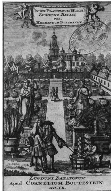
Figure 1: Frontispiece of Herman Boerhaave's Index , 1710

Reference: Herman Boerhaave. 1710. Index plantarum quae in horto academic Lugduno-Batavo reperiuntur . Lugduni Batavorum: Cornelius Boutestein. University Library Cologne, N 10/45.