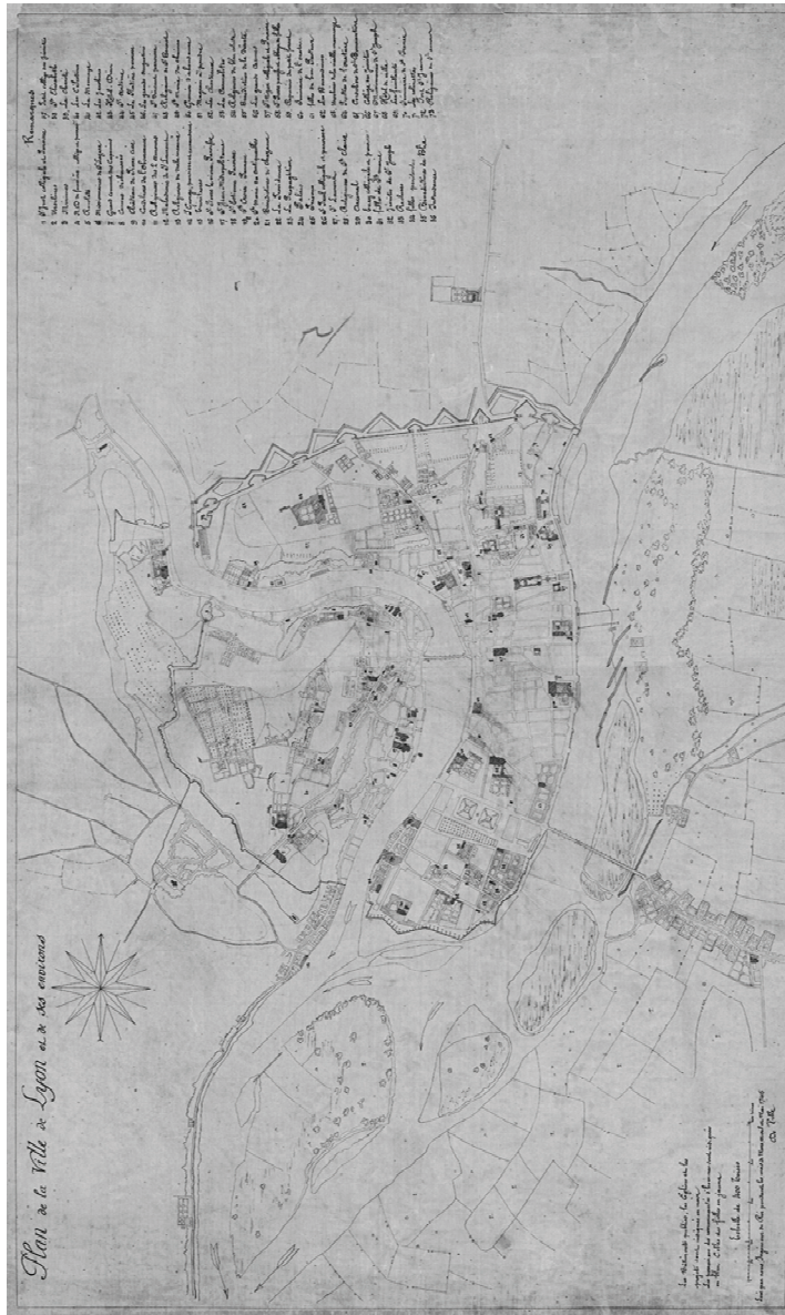
Figure 1: City Map of Lyon and its Surroundings, 1745