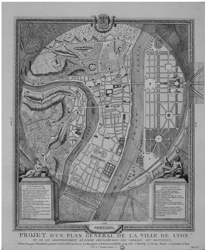
Projet d'un plan général de la ville de Lyon et de son agrandissement en forme circulaire dans les terrains des Brotteaux [1764], présenté à Monsieur, Frère du Roi, lors de son passage à Lyon, le 6 septembre 1775, 44 x 60 cm, scale: 1:9.000, etching.

Morand first presented his eastern expansion project – also referred to as “ville circulaire,” “ville ronde,” or “nouvelle ville” – in 1764 to the Hôtel-Dieu, and then in 1766 to the city council. The round form is clearly recognizable on the map, but as far as I know, Morand did not write a longer treatise justifying this form. The circle was the ideal form of the Renaissance city (Bramante, Filarete,