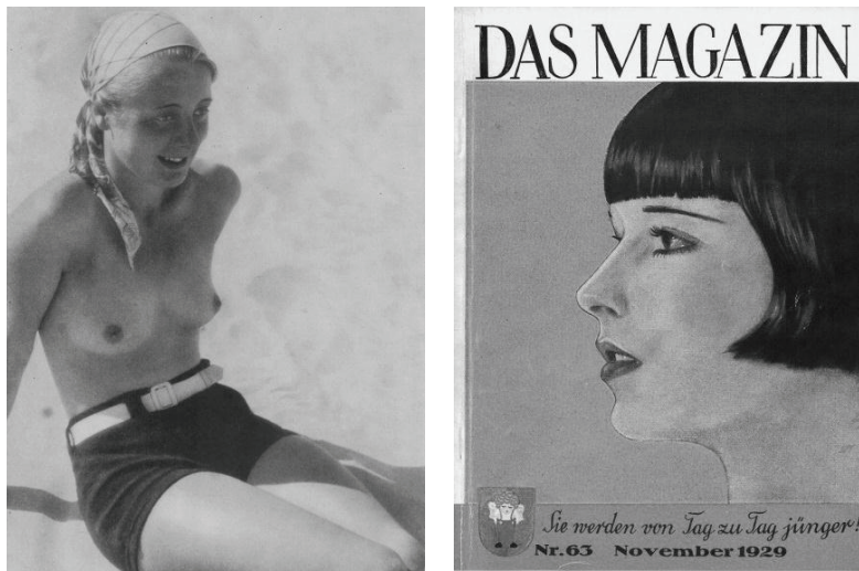
Figure 3: Examples of Visual Frames of the "New Woman" in Magazines

The accompanying texts also offer plenty of pointers for gender studies, as the title "A Harem After Your Own Heart" already suggests; according to the editors, this invitation to the gentlemen immediately drew a storm of protest from female readers who demanded the same right for themselves. Even if the