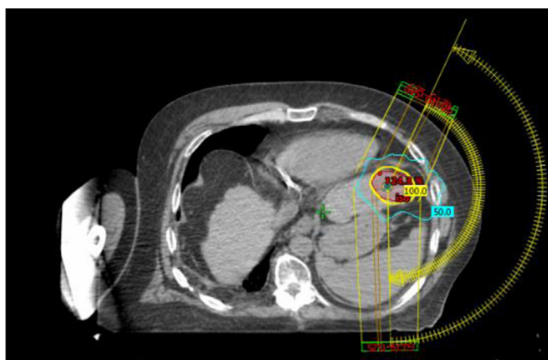
Figure 1 Image of the stereotactic body radiation therapy plan for the treatment of a unifocal hepatocellular carcinoma of the left lobe of the liver with radiation completed in January 2016. The teal line represents the 50% isodose line and the yellow line represents the 100% isodose line, which encompasses the tumor. The patient underwent orthotopic liver transplantation in August 2016 and was found to have a right diaphragmatic hernia. Minimal dose was delivered to the right diaphragm as seen on this representative axial slice.

None of the patients experienced radiation-related operative or postoperative complications. One patient with a CP score of B7 treated with SBRT for unifocal HCC located in the left lobe of the liver measuring 2.9 cm completed radiation in January 2016 and underwent LT 7 months later in August 2016. He was found to have a diaphragmatic hernia that was considered to possibly be radiation related. The patient's liver lesion was left sided with minimal to no dose at the location of the right-sided hernia, as seen in Figure 1 , and therefore deemed unrelated to radiation. Another patient with a 2.7 cm unifocal HCC in segments 7 and 8 received SBRT in June 2016