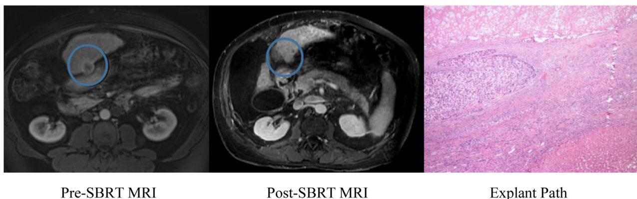
Figure 2 Clinical complete response demonstrated on post-stereotactic body radiation therapy magnetic resonance imaging on September 26, 2017, which was discordant with explant pathology, which revealed pathologic partial response (pPR). The blue circle on the magnetic resonance imaging highlights the location of the tumor. Stereotactic body radiation therapy was completed October 9, 2016 (30 Gy in 5 fractions) and liver transplantation was performed October 30, 2017.

SBRT as a bridging modality provides comparable pCR rates and dropout rates to that of other local therapies, of which the most commonly reported are TACE and RFA. In a study by Sapisochin et al, RFA, TACE, and SBRT outcomes were compared with pCR rates of 49.2%, 24.3%, and 13.3%, respectively. 6 Of note, these patients were offered SBRT because they were ineligible for other treatments due to poorer baseline liver function, technical limitations, or progression after TACE/RFA. RFA was delivered to patients with smaller and fewer lesions. Dropout rates for the 3 modalities were not significantly different, ranging from 16.7% for SBRT, 20.2% for TACE, and 16.8% for RFA. 6 Mohamed et al 15