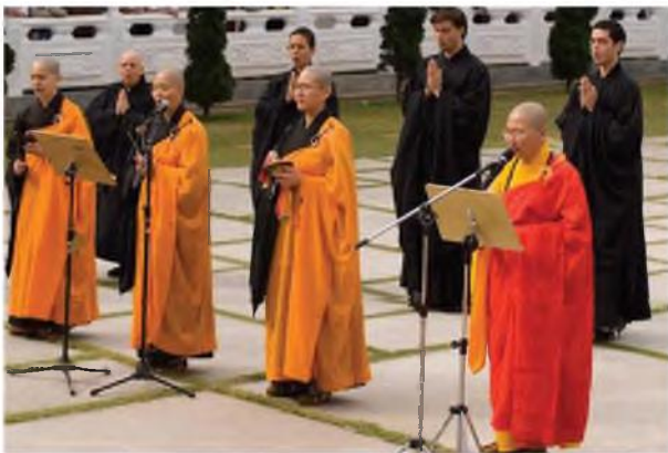
Recitation at the Zu-Lai Temple in São Paulo

If one generalizes the well-documented statistical decline of ethnic Buddhism in Brazil over the last decades and suppose that other countries have witnessed similar dynamics, then only a relatively small proportion of the enlisted Mahayana-Buddhists should be taken as an indicator of the current relevance of ethnic Buddhism in South America. On the other hand, besides more than eighty ethnic-based Shin-Buddhists communities, there is a series of ethnic Buddhists communities in the region. In this context there are traditional Zen institutions with a strong ethnic background such as the Busshinji Temple in São Paulo and Daishinji Temple in Bogota. Another example is the Tzong Kwan Temple in São Paulo, built with the extensive financial help of the Taiwanese order and the local Chinese community, and which served after its inauguration by the Buddhist master Pu Hsien in 1993 as a model for the construction of two “sister” institutions, one in Argentina the other in Paraguay. 22 In a similar category falls the Fo Kuang Shan-order whose religious activities in countries such as Brazil, Chile, Argentina and Paraguay are supported by local Chinese communities.