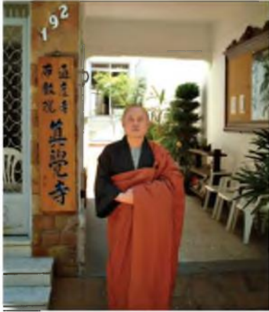
Minister of the Jin Kak Temple in São Paulo

idea of the East and particularly of Japan constructed by the early writings of Brazilian philosophers, novelists, poets, and historians