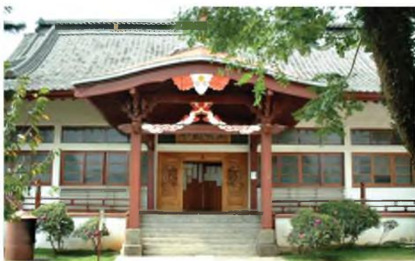
Tendai-Temple in São Paulo, Photo: Rafael Shoji (2004)

The general statistical strength of the Brazilian Buddhist institutions is reflected in a numerical overweight of certain Buddhist branches. This is true for Amida Buddhism represented in South America by eighty-four temples of which 90% are located in Brazil. Another example is the New Kadampa Tradition with followers in Brazil (more than twenty centers) and in Chile (three local institutions). More striking is the situation of Buddhist branches restricted to Brazil as in the case of Honmon Busuryushu (eleven institutions), Shingon (five) and Tendai (two).