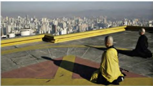
Zen-Meditation on the top of the Copan-Building in São Paulo

Spanish speaking countries. Due to the existence of approximately 300 centers, dojos, groups and temples and around 230,000 self-declared Buddhists, more than 50% of the Buddhist institutions and around 47% of the South American Buddhists are located in Brazil. This tendency correlates with the fact that Brazil's population (185.7 million in 2010 15 ) is nearly as high as the estimated population of the rest of South America. 16