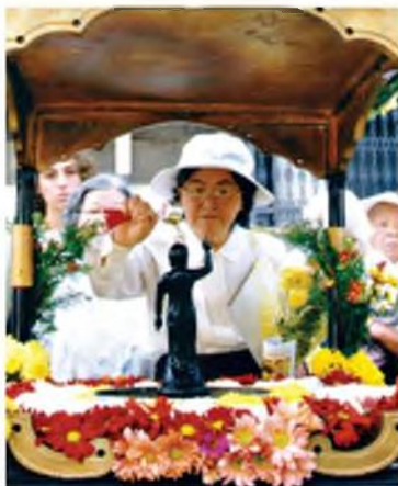
Religious celebration of the Japanese community in São Paulo, Photo: Frank Usarski (2001)

Correlation between the questionnaire’s categories “color” (= “race”) and “religion” indicate that the absolute number is composed of 81,345 Brazilians that identified themselves as having “yellow” skin and 133,528 individuals who opted for an alternative item on the respective fivefold scale (besides “yellow”, “white”, “brown”, “black” and “indigenous”).