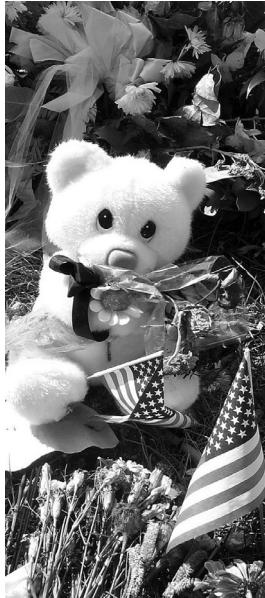
Temporary memorial created in September 2001 featuring a teddy bear and flowers at the Pentagon, Arlington, VA.

Visitors brought bouquets of flowers, candles, cards, and a copy of the Torah, signed their names in the two public comment books that the museum provided, and posed for photos in front of the display. Collecting and displaying such space shuttle shrine material – called ‘grief’s memorabilia’ by staffers – has now become part of the museum’s curatorial agenda. 29