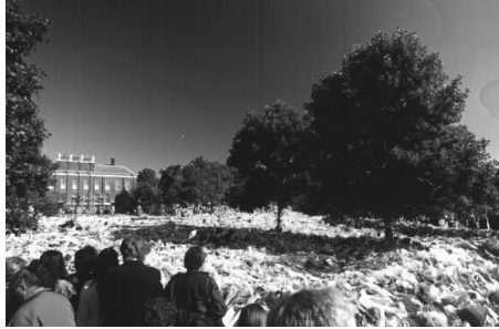
Temporary memorials to Princess Diana in front of Kensington Palace, London, September 1997.