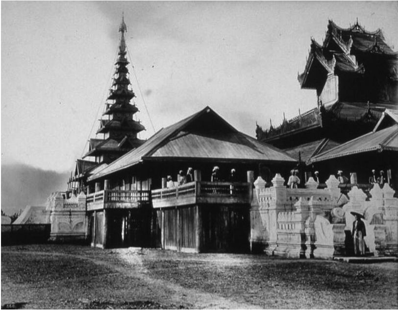
Kengtung: sawbwa's haw or palace, c. 1890