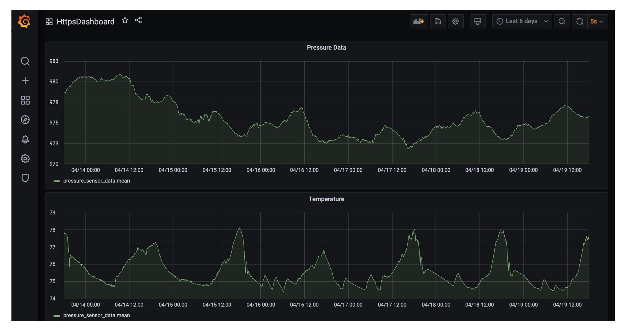
Fig: Data visualization using Grafana