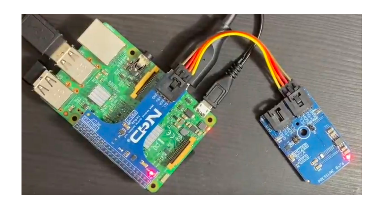
Fig: Prototype consist of Raspberry Pi4 connected to a BMP180 pressure sensor that transfers the data using a 12C Shield digitizer.