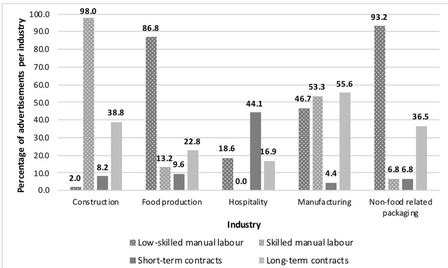
Fig. 2 Percentage of advertisements offering low-skilled manual, skilled manual labour as well as short-term and long-term contracts within the five most represented industries in the sample

Of a possible ten indicators of trafficking, the median for the sample was 3 indicators, with a standard deviation of 1.5. Almost all advertisements had at least one indicator