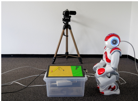
Figure 1: The setup of the Intelligent Tutoring System (published with permission from [10]).

The goal of this study was to investigate whether the implemented tutoring system was successful at teaching children English vocabulary, whether children learned more when interacting with a robot and a tablet compared to only having a tablet present, and whether the robot's use of iconic gestures resulted in higher learning gains than when the robot did not use iconic gestures. To ensure repeatability of the study, the experimental design and the proposed analyses were preregistered and the source code of the implemented system is made publicly available. Although research suggests that the learning process can be supported by a robot's physical presence and its ability to exhibit socially intelligent behavior [4], the results of our study do not provide evidence to support these claims [10]. A possible explanation for this is that the robot's social supportive behavior was limited due to various technical limitations (outlined in the following sections) and subsequent design decisions. In