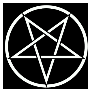
Fig. 2. A pentagram.

In the video, the logo stands alone without any explanatory text or background graphics. While one aspect of its resemiotization is its trajectory from a pictorial