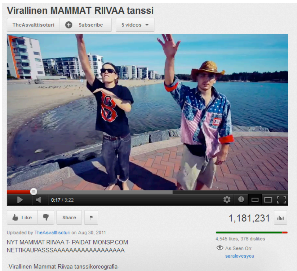
FIGURE 3: A screenshot of the official Mammat riivaa dance video (Endnote 9)