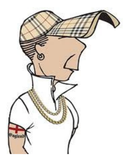
Figure 1: The chav

Chav identity, as articulated for instance on YouTube, is flagged by means of features including obesity, smoking, street drinking, rowdiness, teenage pregnancy, unemployment and, surprisingly, one particular fashion feature. Soccer player Wayne Rooney would be the archetypical chav. In getting the right amount of recognisable 'chav', a very small semiotic dose is in fact enough for a certain identity discourse to be activated. Here the metaphor of medication is perhaps useful: just as the pain killer we take to get rid of a headache features one active substance in the dose that takes away the pain – while the rest of the content can in fact be totally irrelevant for achieving that aim – in producing an authentic identity all is needed is one active substance in the dose.