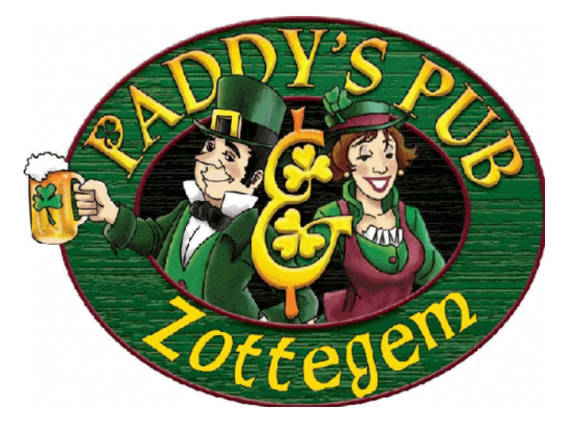
Figure 4: Paddy's Pub, Zottegem. <u>www.irishpub.eu</u>

Let us now turn to the globalized features, the 'active substances' as we called them. Running through about one hundred Irish pub websites (and having visited a good number of such pubs ourselves), we see that a small handful of emblematic features appear in almost every case; we can list them. But before we do that, let us have a look at one illustration, in which we see several of the emblematic items. In Figure 4, we see a coaster from an Irish pub in the small Belgian town of Zottegem: