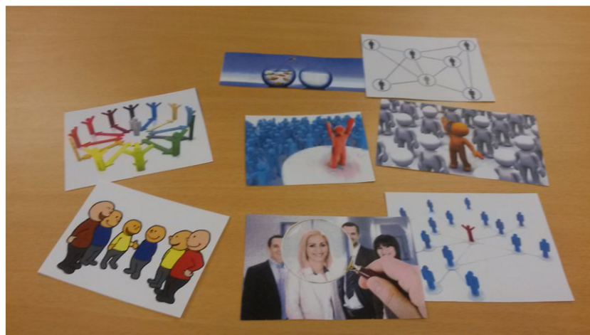
FIGURE 1 Example of a cluster of visual statements made by one of the 17 participants in the structuring step of the concept mapping