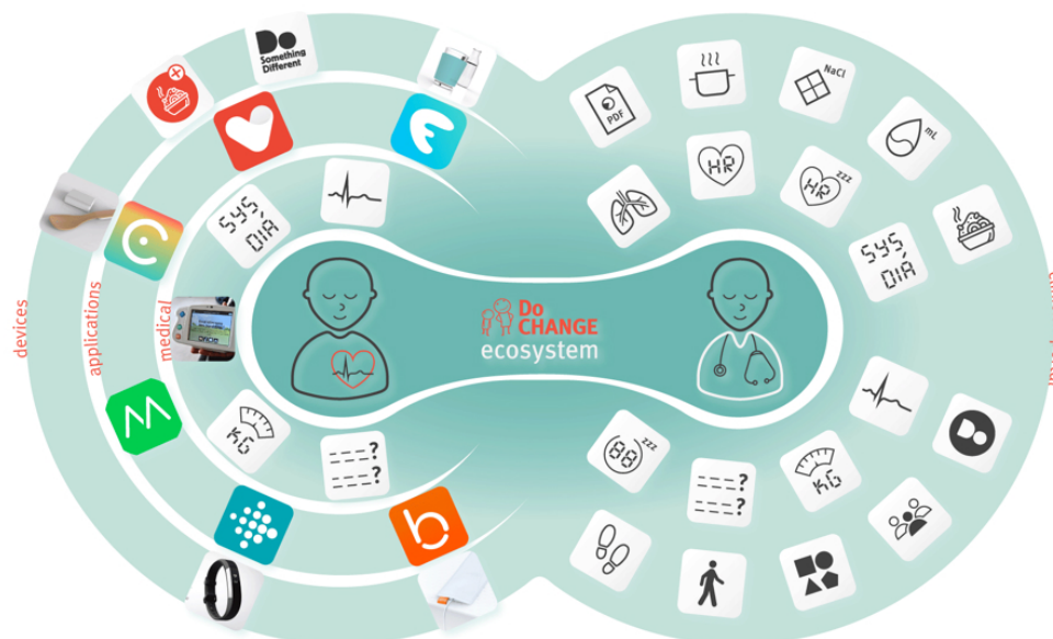
Figure 2. Schematic overview of the Do CHANGE intervention components.

COOKiT is a smart spatula that can monitor patients’ cooking behavior (through a motion sensor which indicates whether the spatula is used) and measure the salinity—for both sodium and potassium—of the food that is prepared. The COOKiT has been developed within Do CHANGE and will be provided to patients two months postbaseline measurement.